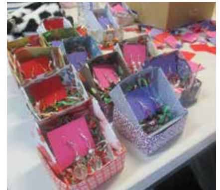
Earrings to be sold at our market day