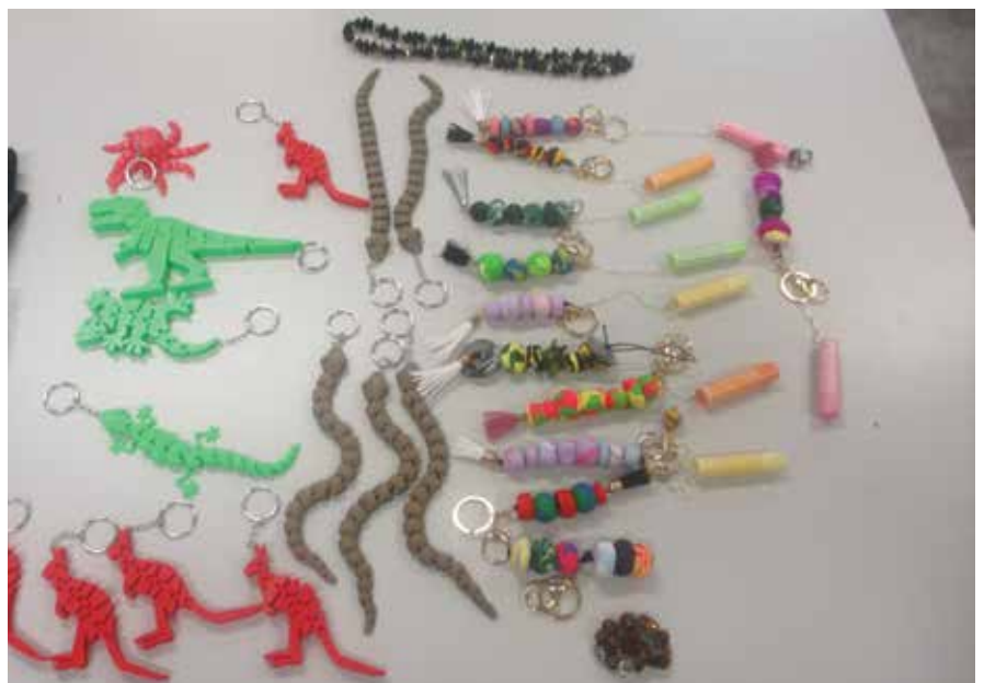
Keychains to be sold at our market day