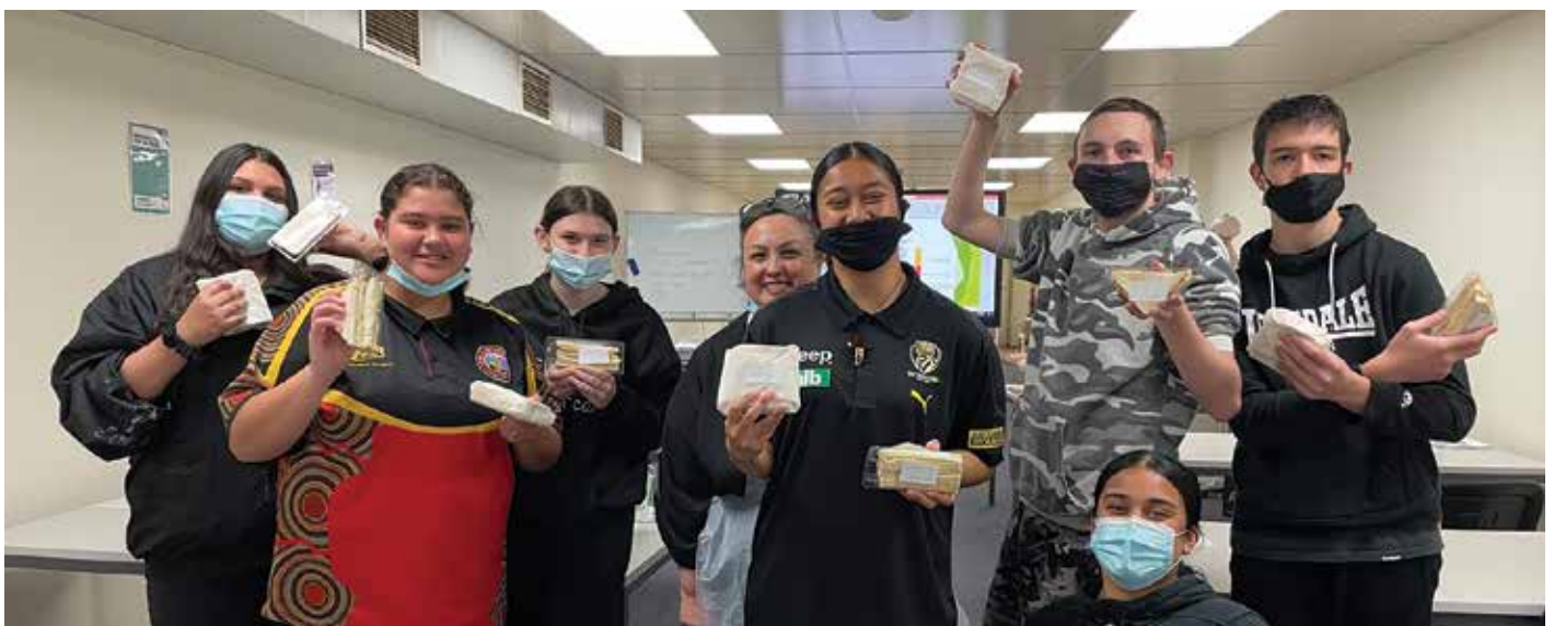
Students who completed Food Handling course with Cathy Z.