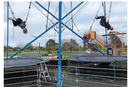
Boys on trampoline at Echuca excursion