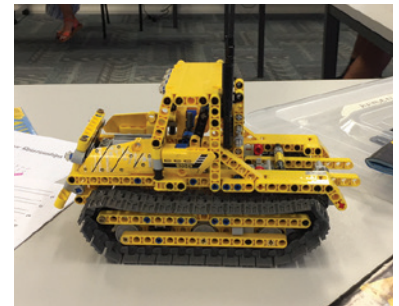
Hayden Parisotto's almost complete construction.